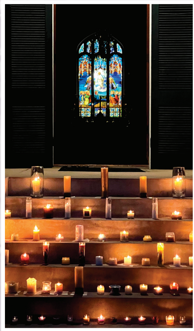
"The Ascension" altar window at Trinity Church was created by John La Farge and installed in 1884. It is the only La Farge window in Mississippi and one of a few outside the Northeast.