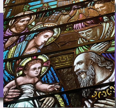
"Adoration of the Magi" window at Trinity Episcopal Church